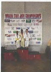
First State Champion