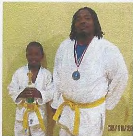
Father & Son Champions

No strikes, punches or kicks. Uses your attackers energy against them. The only martial art in the Olympics. Soccer is the only sport with more players worldwide. The first event to sellout at the Olympics. Being a better person is the goal of judo not just winning.