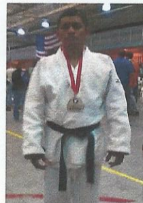
2012 silver medalist in the prestigious Tohken Classic in Chicago, IL.