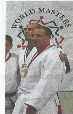
World Masters Bronze Medalist