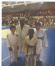
2014 State Championship Team